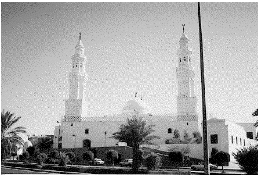
Masjide Dhul Qiblatayn – Madina

The mosque where this happened is known as "Masjide Dhul Qiblatayn" which means "The Mosque with the Two Qiblahs". This mosque still exists in Madina and the old and new Qiblahs can still be seen there today.