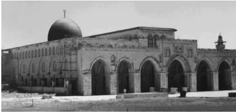
Masjidul Aqsa, Jerusalem

In Madina, the Jews also said their prayers facing Baytul Muqaddas. They did not like the fact that the Muslims had the same Qiblah as they did, and tried to use this fact to discredit Islam and the Holy Prophet (S). They said to the Muslims, "Muhammad claims to have a religion whose laws supersede all other previous laws, yet he does not have an independent Qiblah, and offers his prayers facing the Qiblah of the Jews."